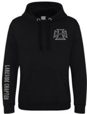
Lakeside Chapter Adults Heavyweight Hoodie