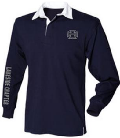
Lakeside Chapter Rugby Shirt