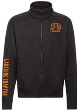
Lakeside Classic Adults Sweatshirt Jacket