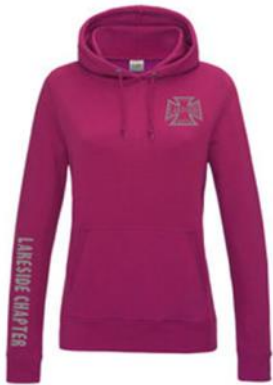
Lakeside Chapter Ladies Hoodie