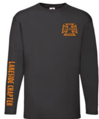
Lakeside Chapter Adults L/S T Shirt