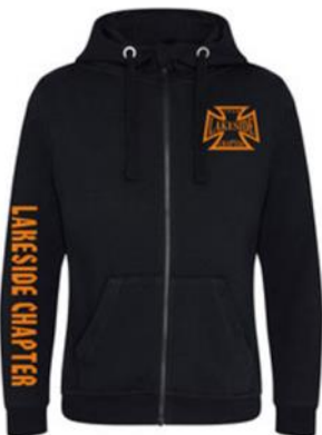
Lakeside Chapter Adults Heavyweight Hoodie