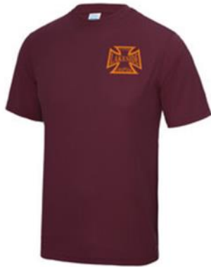
Lakeside Chapter Adults Cool T-Shirt