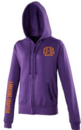
Lakeside Chapter Ladies Zip Hoodie