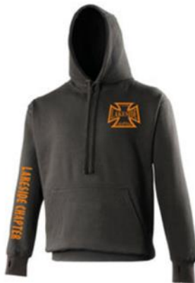
Lakeside Chapter Adults Street Hoodie