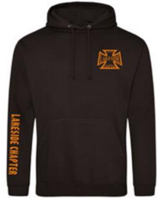
Lakeside Chapter Adults Hoodie