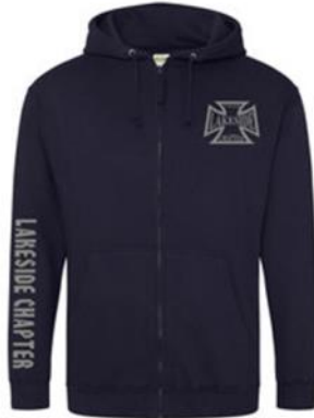
Lakeside Chapter Adults Zip Hoodie