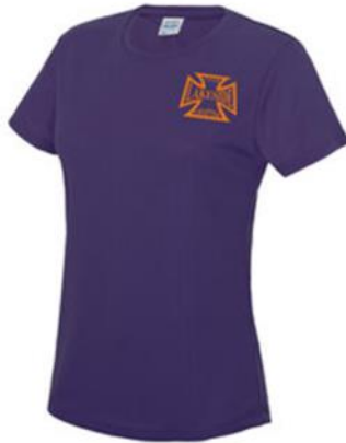
Lakeside Chapter Ladies Cool T-Shirt