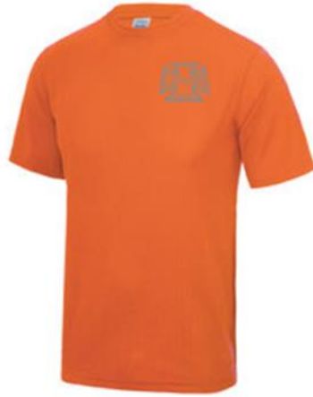
Lakeside Chapter Junior Cool T-Shirt