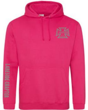
Lakeside Chapter Junior Hoodie